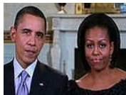
Obamas: Bullying No Longer a Part of Growing Up