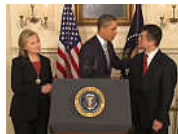
Meet Gary Locke - New U.S. ambassador to China