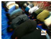
King hearings called a witch-hunt