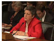
Napolitano responds to ATF "gun running" probe

Comments (1) Bias Detector 17 hours ago Report Abuse You must be logged in to report abuse.