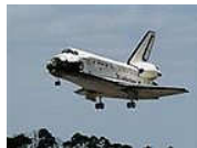
Raw Video: Discovery Lands for Final Time