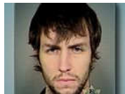
Honest Trespasser Calls 911