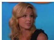
Hasselbeck Lashes Out at TV Host