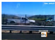
Wrong-Way Driver Crash Caught on Video