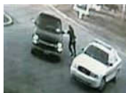
Suspect Drags Ky. Police Officer