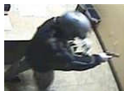
Suspect in Las Vegas Casino Heist in Court