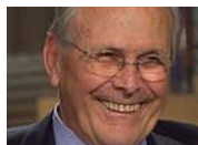
World Exclusive: Donald Rumsfeld