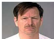
New Murder Charge Filed in Green River