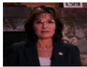
Sarah Palin Responds to Tucson Shooting