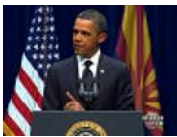
Obama Honors Tucson Victims at Memorial