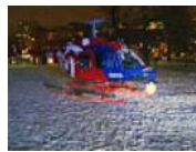
News Chopper Crash Lands in Central Boston