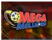
$190 Mil Share of Mega Millions Jackpot Claimed