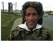
Golden-Voiced Man Heads to Rehab