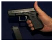
Gun Control Debate Reignited