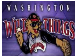
'Burgh's Other Teams