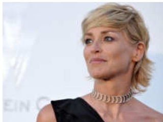
Local Oscar Ties